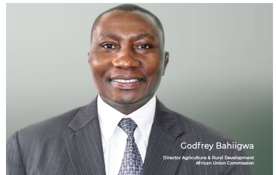
Godfrey Bahigwa Director Agriculture & Rural Development African Union Commission

A series of sessions and events at AGRF2021 highlighted how these priority areas would be implemented. The session on Accelerating Action – Food Systems Transformation highlighted the existence of over 40 game changing solutions representing a coordinated African voice that will be taken to the UNFSS to support the action areas. Through these game changing solutions, Africa will call for action at all levels of the food system, including national and local governments, companies, and citizens. Key aspects of the proposed solutions include: