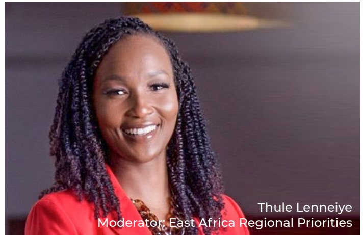
Thule Lenneiye Moderator: East Africa Regional Priorities