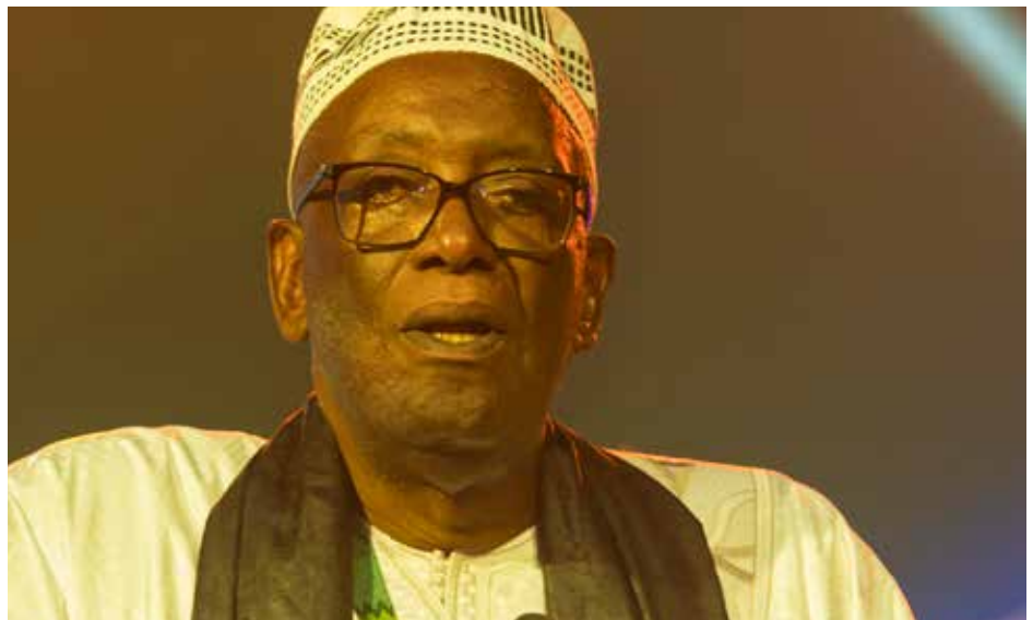
Baba Dioum, 2019 Africa Food Prize Laureate