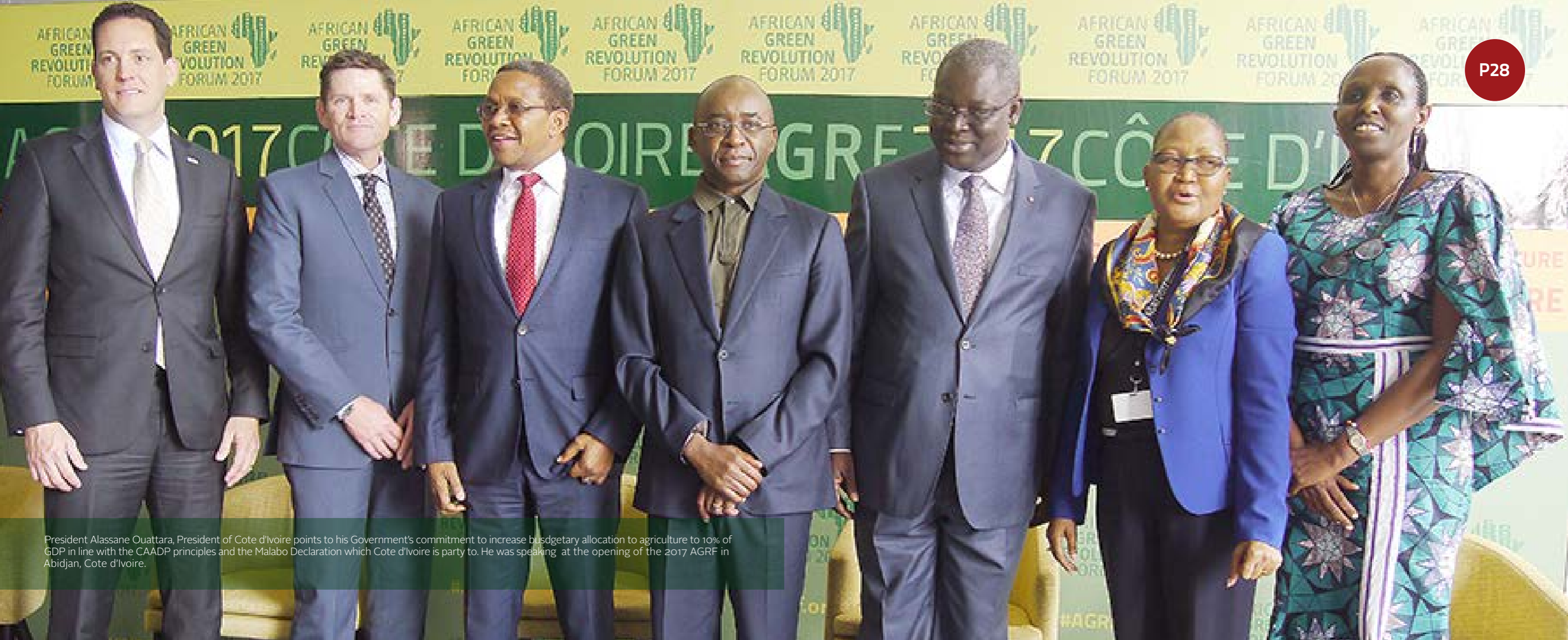
President Alassane Ouattara, President of Cote d'Ivoire points to his Government's commitment to increase budgetary allocation to agriculture to 10% of GDP in line with the CAADP principles and the Malabo Declaration which Cote d'Ivoire is party to. He was speaking at the opening of the 2017 AGRF in Abidjan, Cote d'Ivoire.

"We have witnessed significant progress in our agricultural transformation over the past decade, with countries that have prioritized the sector recording notable drops in poverty levels, improved food security and inclusive economic growth. PIATA will be critical in bringing key players together to support governments in their push to fully unlock the potential of Africa's smallholder farming and agribusiness as the surest drivers of job creation and the continent's inclusive economic transformation," she said.