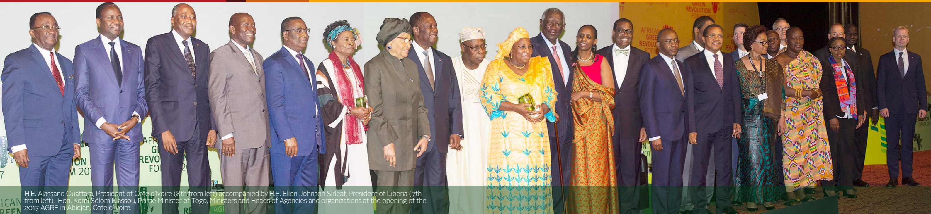
H.E. Alassane Ouattara, President of Cote d'Ivoire (8th from left) accompanied by H.E. Ellen Johnson Sirleaf, President of Liberia (7th from left), Hon. Komi Sélom Klassou, Prime Minister of Togo, Ministers and Heads of Agencies and organizations at the opening of the 2017 AGRF in Abidjan, Cote d'Ivoire.